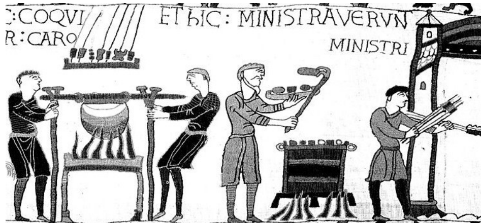
Plates, Platters, Trenchers and other Feast Gear

Many folk in the SCA take pride in collecting a set of pretty feast gear which usually includes a plate, bowl, cup, knife, fork and spoon. Is this what they really did in the middle ages? Obviously, the answer may depend on the time and place; but there are some generalities for medieval Europe.